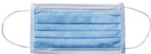
99F1 - Type IIR